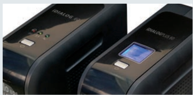
Particolare dei display